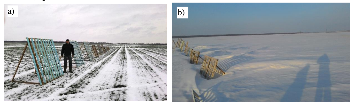
Fig. 1. Impact of barriers on snow retention in Saratov region: 1 – barriers in the fall; 2 – result of snow retention in winter)

In winter, during snowstorms, snow begins to move at the wind speed of 2.5-3.0 m·s<sup>-1</sup>. At the speed of 7-8 m·s<sup>-1</sup>, up to 90-95% of snow is blown away and transported at the height of 0.1-0.2 m. Creation of barriers in the fields located across the direction of prevailing winds contributes to significant snow retention (Fig. 1).